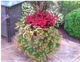
14" Terra Cotta Urn Combo of plants $24

All pictures represent previous plants sold; actual styles may vary.