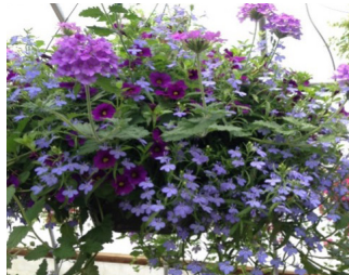
12" Hanging Plant Mix of 2 Annuals $22